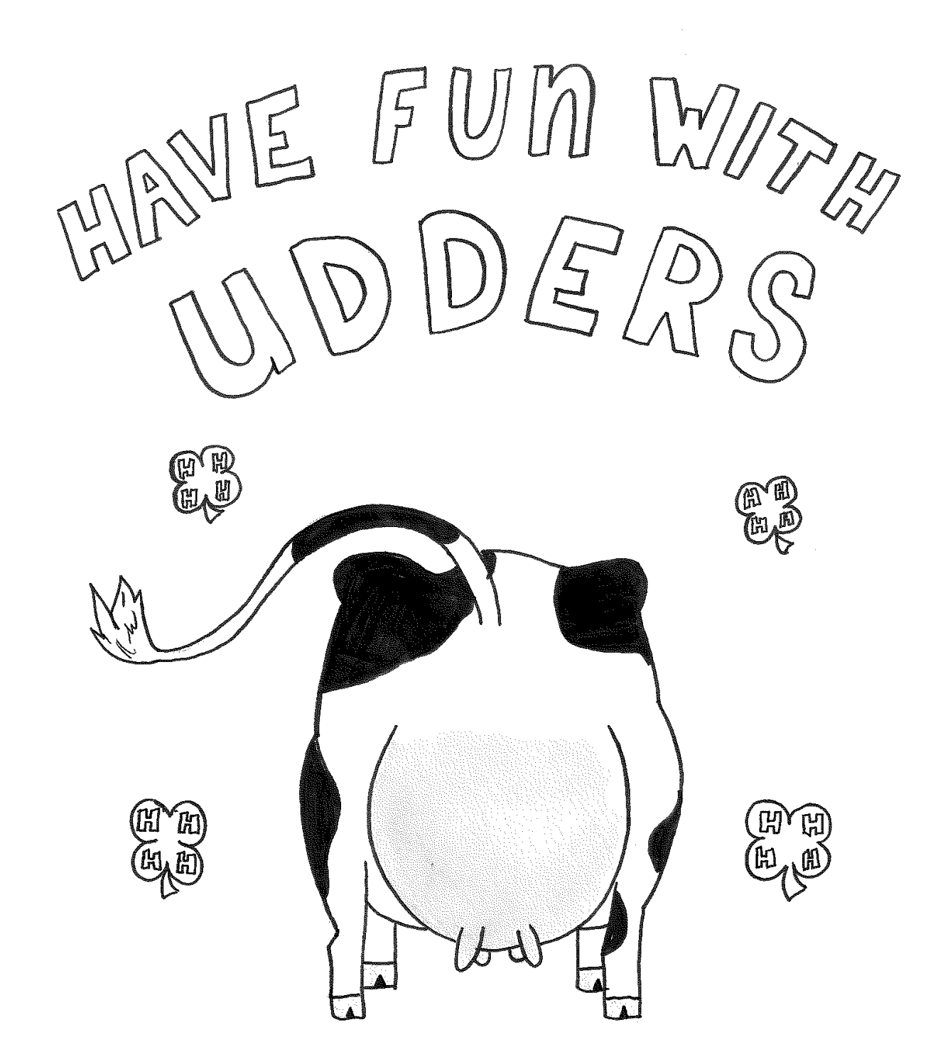
AT THE 2024 WASHTEN AW COUNTY 4-H YOUTH SHOW